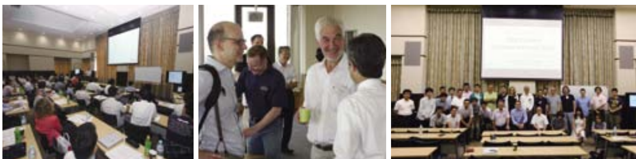
Image from the 2015 Hitotsubashi Summer Institute held from July 31 to August 11, 2015.

HIAS will give priority to important contemporary research topics that are the focus of international attention, and we will proceed in pursuit of results. Specifically, we intend to give precedence to our sabbatical system for “leading-edge” researchers at the university, that is, faculty members who have shown success in their research and begun to demonstrate consistent achievements at a global level; we also hire such scholars as our HIAS faculty, in addition to their current positions at the university. Moreover, we will also invite world-