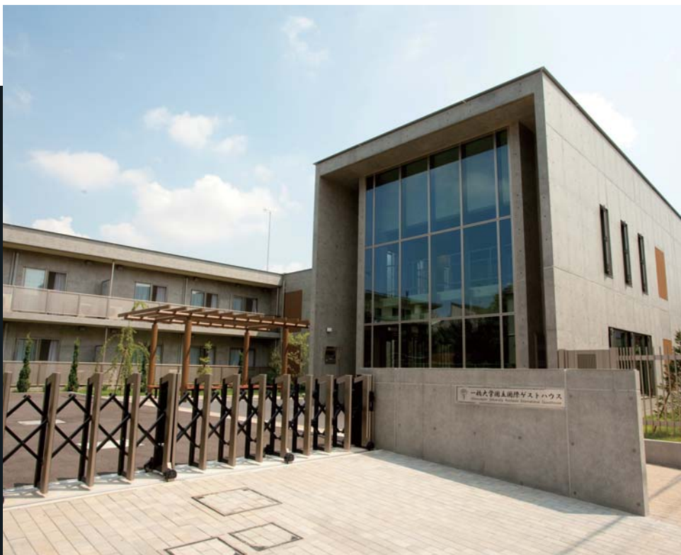
Kunitachi International Guesthouse: Overview

With the completion of this new guesthouse, there are now three housing facilities on the Kunitachi Campus and one housing facility on the Kodaira Campus for overseas researchers.