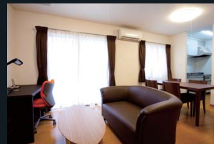
Room for married students