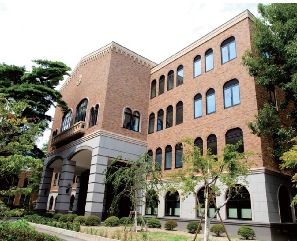
Faculty Building 3: Overview

Our core aim, therefore, was to create a well-equipped and congenial space for long- and short-term visitors from overseas to perform their research. Our other aim was to provide support so that young researchers could perform their work in an excellent environment.